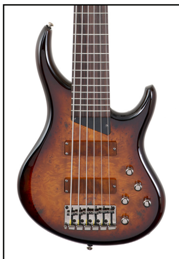
MTD Kingston Z 6-string

What made you decide to create the Kingston line of basses?